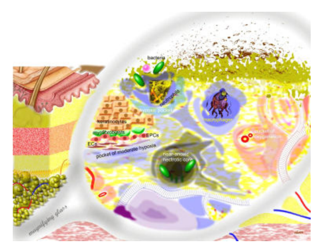
Figure 2. Heterogeneous distribution of oxygen in the wound tissue: hypothetical pockets of graded levels of hypoxia. Structures outside the illustrated magnifying glass represent the macro tissue structures. Objects under the glass represent a higher resolution. Shade of black (anoxia) or blue represents graded hypoxia. Shade of red or pink represents oxygenated tissue. Tissue around each blood vessel is dark pink in shade representing regions that are well oxygenated (oxygen-rich pockets). Bacteria and bacterial infection are presented by shades of green on the surface of the open wound.

heart disease, high altitude) may contribute to wound hypoxia as well. Depending on factors such as these, it is important to recognize that wound hypoxia may range anywhere from near-anoxia to mild-modest hypoxia.<sup>20</sup> In this context, it is also important to appreciate that point measurements<sup>28</sup> performed in the wound tissue may not provide a complete picture of the wound tissue biology because it is likely that the magnitude of wound hypoxia is not uniformly distributed throughout the affected tissue especially in large wounds. This is most likely the case in chronic wounds presented clinically as opposed to experimental wounds, which are more controlled and homogenous in nature. In any single problem wound presented in the clinic, it is likely that there are pockets of near-anoxic as well as that of different grades of hypoxia (Figure 2). As the weakest link in the chain, tissue at the near-anoxic pockets will be vulnerable to necrosis, which in turn may propagate secondary tissue damage and infection. Pockets of extreme hypoxia may be flooded with hypoxia-inducible angiogenic factors but would fail to functionally vascularize because of insufficient O<sub>2</sub> that is necessary to fuel the